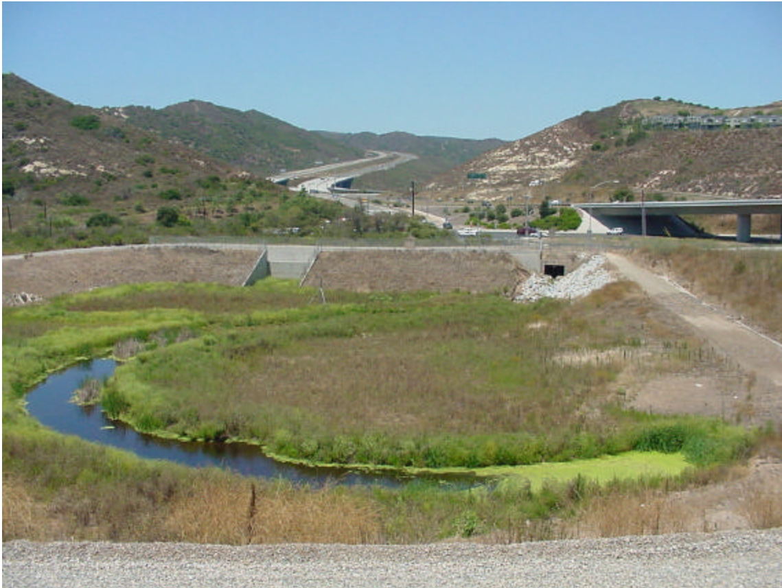
Figure D-10 Laguna Audubon Basin

In late 1992 a BMP effectiveness evaluation was conducted on the Laguna Audubon Basin. The evaluation entailed monthly dry-weather monitoring of the influent urban runoff and the discharge from the basin to Laguna Canyon Wash. Although the amount of data was limited, the results suggest that the basin is effective, during dry-weather conditions, in reducing suspended particulates and associated adsorbed pollutants.