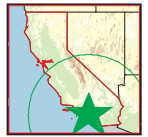
Laguna Beach, CA